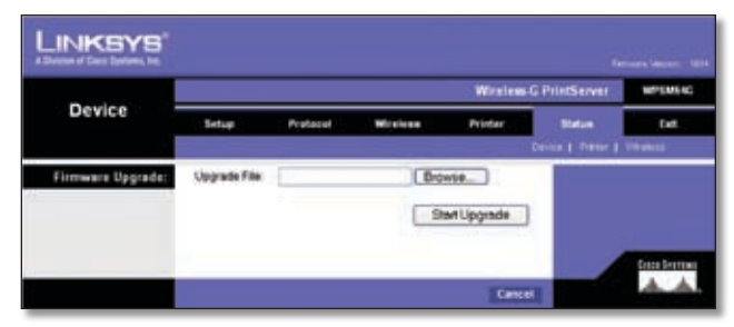
Status > Device - Firmware Upgrade

When you have finished upgrading the PrintServer's firmware, follow these instructions: